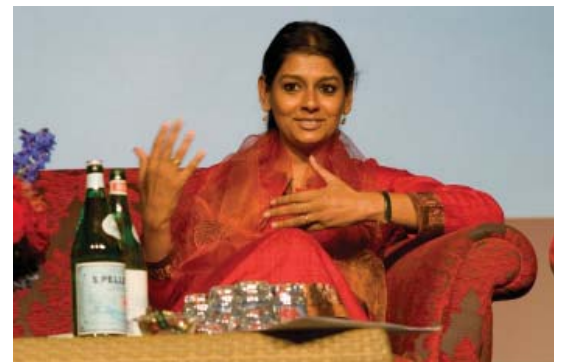
Nandita Das, Indian Film Director, Actress, Social Advocate and IWF Hall of Fame Honoree (2011)